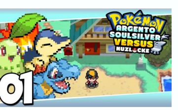
Pokemon soul silver randomizer nuzlocke rom. What is a nuzlocke randomizer. How to get nuzlocke randomizer on switch. Pokemon soul silver randomizer nuzlocke download. Pokemon randomizer nuzlocke settings. Universal pokemon randomizer nuzlocke settings. Pokemon heart gold soul silver randomizer nuzlocke download.